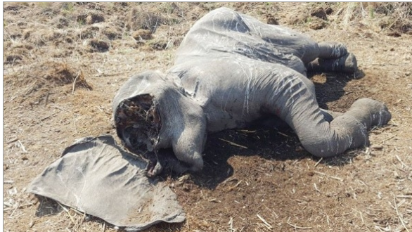
Elephant carcass